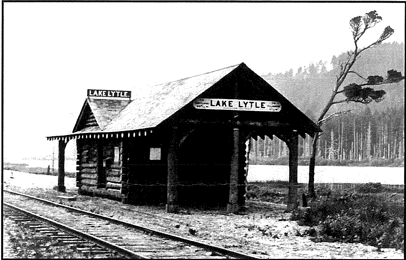
Close-up view of the Pacific Railway & Navigation Company depot and Post Office at Lake Lytle, circa 1913.

Lake Lytle is among the five post offices that were established on Garibaldi Beach (now known as Rockaway Beach). The beach stretches seven miles from Tillamook Bay to Nehalem Bay, and also included the post offices at Twin Rocks, Bar View, Manhattan Beach and Rockaway Beach. With the building of the railroad it became a premier destination for vacationers from Portland and the Willamette Valley. Today the area has many permanent as well as second homes. Lake Lytle is located between Rockaway Beach to the south and Manhattan Beach to the north. The original development was centered around 9th Avenue.