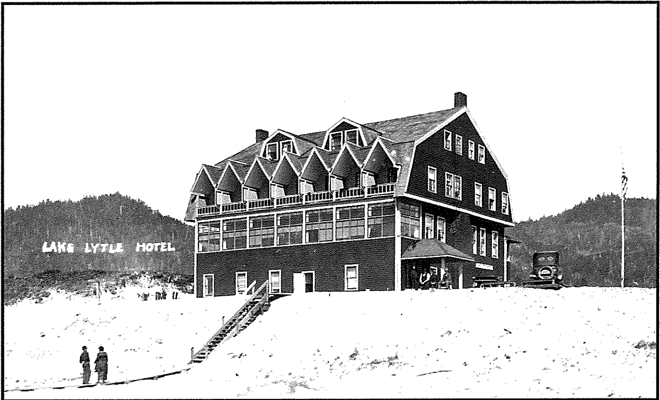
Postcard view of the Lake Lytle Hotel, circa 1921.

An undated message on the back of the real photo post card above provides a glimpse into one guest's exciting stay at the hotel: