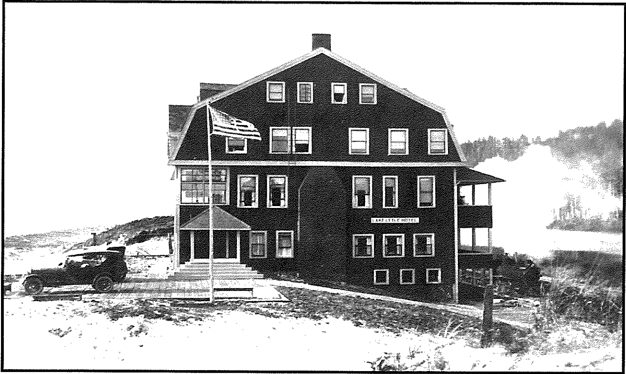
Postcard view of the Lake Lytle Hotel from the south, circa 1923.