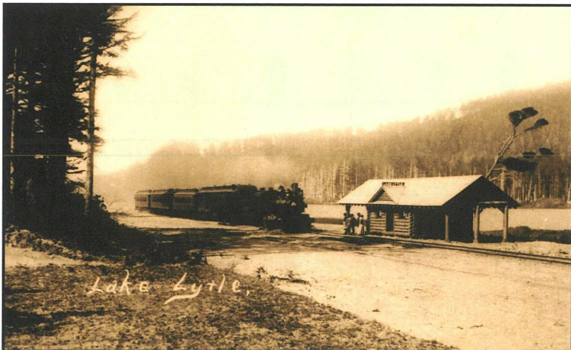
Postcard view of the depot at Lake Lytle circa 1913 from the Larry Maddux Collection.